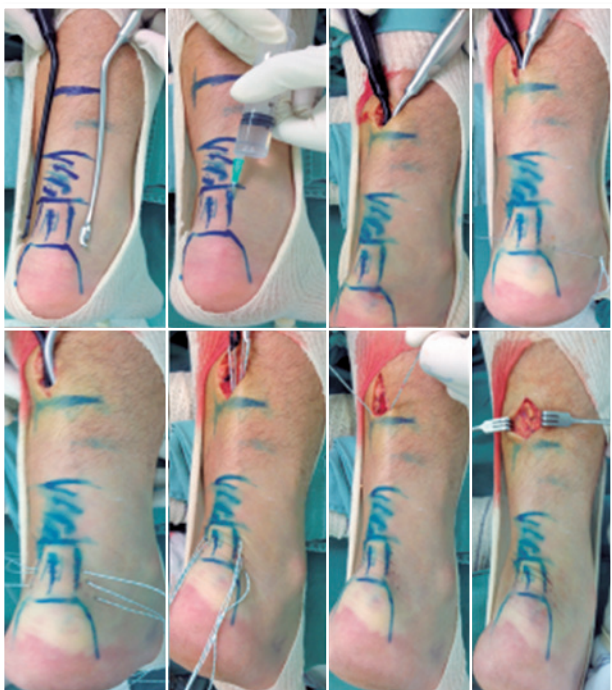
Figure 2 | Surgical technique for percutaneous repair of the Achilles tendon with the Dresden technique.

dissection, between the posterior superficial fascia and the paratendon, ensuring that the sutures to be made would remain within the sheath and would not cause damage to the sural nerve, which is subcutaneous. The Dresden instrument (Figure 3) was introduced tangentially to the Achilles tendon along its medial border up to 1cm from the calcaneal tuberosity.