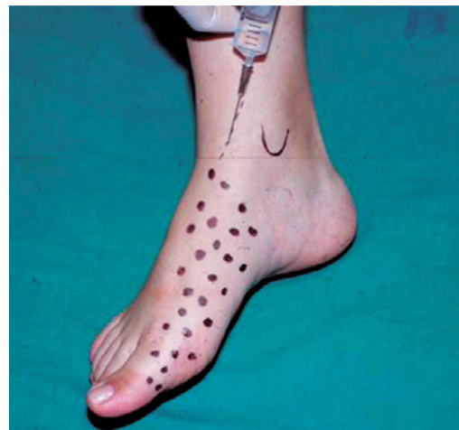
Figure 2 | Sensitive area of the saphenous nerve (Source: Author's personal archive).