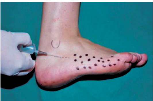
Figure 5 | Sensitive area of the sural nerve.

All the patients were hospitalized for 48 hours after the surgical procedure. We collected the pain intensity data through the Visual Analogue Scale (9) in the immediate postoperative period (considered six hours after the end of the procedure), on the first postoperative day (24 hours after the end of the procedure), and on the second day (considered 48 hours after the procedure). No type of postoperative scheduled analgesia was prescribed. After the onset of pain, its intensity was identified by the visual analogue scale, and only 2mg of intravenous dipyron was given intravenously. No centrally acting analgesic medication such as opioids or benzodiazepines was used.