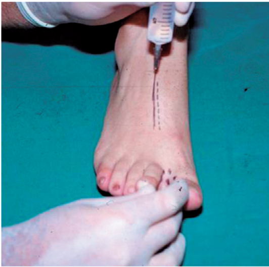
Figure 4 | Sensitive area of the deep peroneal nerve (Source: Author's personal archive).