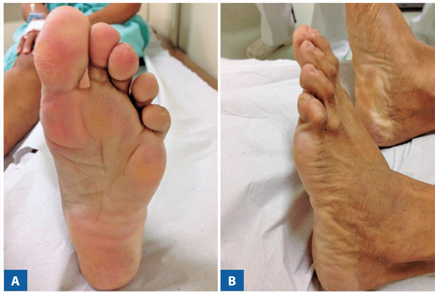
Figure 1 | Preoperative physical examination.

The patient was discharged after 24 hours wearing a cast boot without support. The outpatient return visit took place after one week for Barouk shoe fitting. The stitches were removed at three weeks, and the patient was authorized to start bearing weight in the sixth week following control radiographs confirming osteotomy consolidation (Figures 4A, B and C). At twelve months, the patient retur-