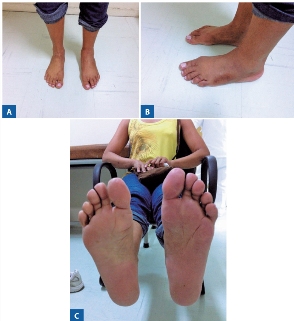
Figure 5 | Postoperative appearance with correction of the deformities and calluses.

Congenital osseous coalitions in the foot are relatively uncommon, present in 1-2% of the population. However, since they are asymptomatic in most people, the true prevalence is probably higher (4,8) . The most common bars that are extensively described in the literature occur between the tarsal bones, typically in children, with calcaneonavicular and talocalcaneal bars being the most common, accounting for more than 90% of cases (1,3,6,8) . Other less common bars include the calcaneocuboid, cuneonavicular, cuboid-navicular (2) and metatarsocuboid types (9) . Intermetatarsal coalitions are rare, so there are few cases described in the global