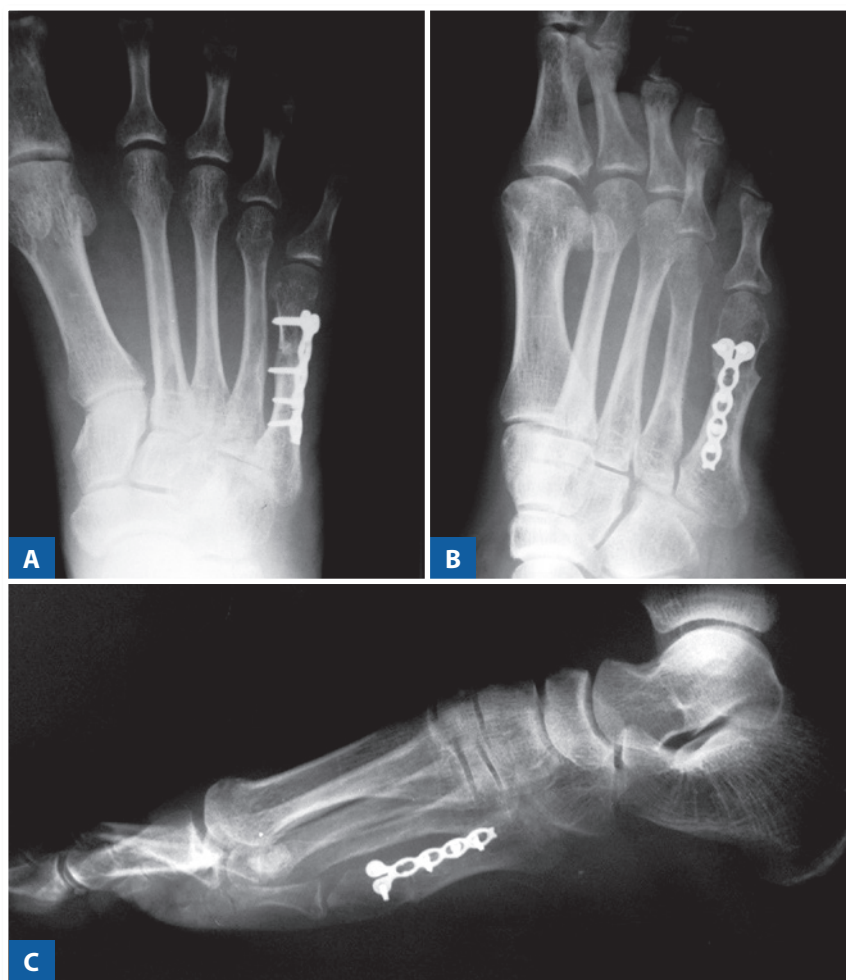
Figure 4 | Late postoperative radiographs of consolidated osteotomy and non-recurrence.