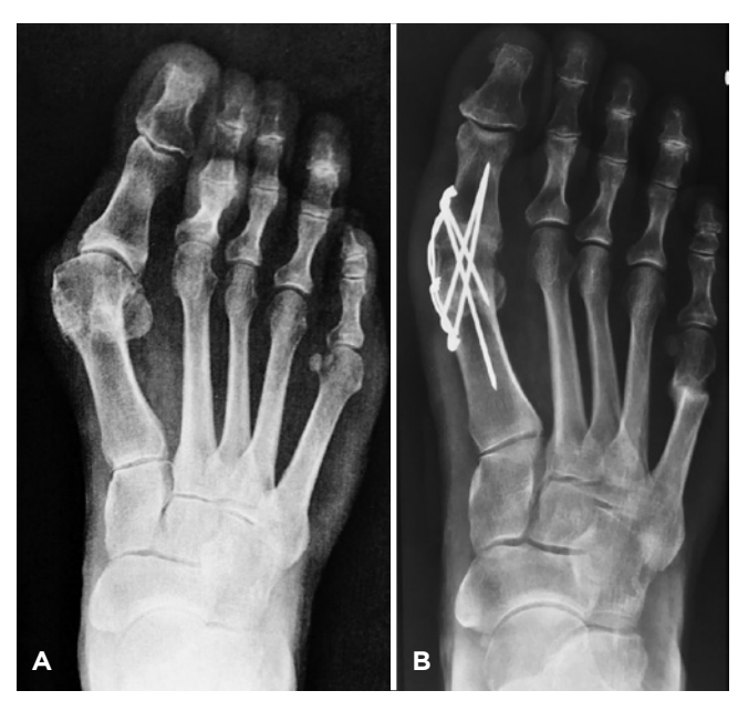
Figure 1. A. Pre and B. Postoperative radiographs.