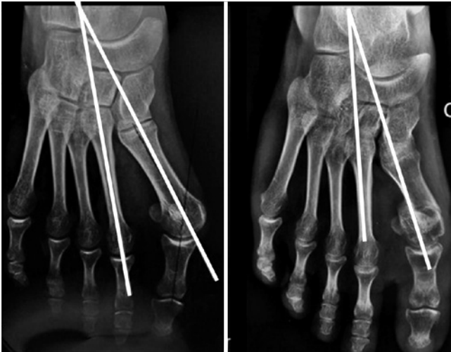
Figure 2. Anteroposterior X-ray showing correction of the intermetatarsal angle - Preoperative (left); and 12 months after surgery (right).