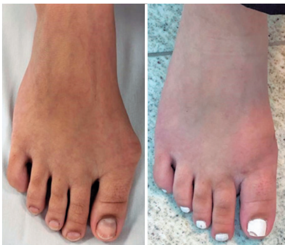
Figure 3. Images illustrating presence of hallux valgus (left); and the result 12 months after the surgical procedure (right).

Table 4 shows the effects of age on reduction of the HVA and IMA angles in this patient sample. The results demonstrated that age group had no statistically significant effect on angle reduction after execution of the PBS technique. It was observed that the mean HVA reduction among patients less than 60 years old was 16° and the reduction among patients over the age of 60 was 13.9°, but this was not a significant difference (p=0.246). With regard to the IMA, the reduction among patients less than 60 years old was 6.8° and the reduction among patients over the age of 60 was 8°, which was also a non-significant difference (p=0.365).