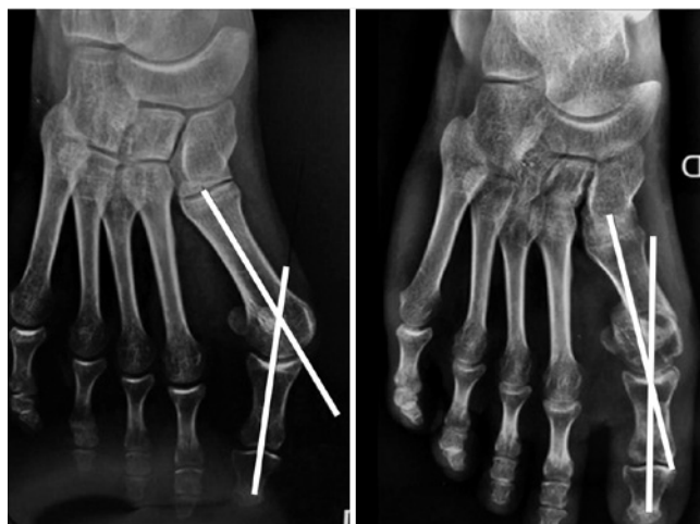
Figure 1. Anteroposterior X-ray showing correction of the hallux valgus angle - Preoperative (left); and 12 months after surgery (right).

Comparing the HVA measurements before the intervention and 12 months afterwards, a statistically significant reduction was observed after use of the PBS technique ( p < 0.001 ) (Figure 2). The patients exhibited mean scores of 22.9 \pm 4.1 preoperatively, which reduced to 7.8 \pm 2.7 during the postoperative period, i.e., there was a mean reduction of 15.1^\circ (95%CI: 13.2 to 17.0). A similar result was observed in the analysis of IMA measurements, in which the mean reduction was 7.3^\circ (95%CI: 5.9 to 8.7), which is a statistically significant difference ( p < 0.001 ). The mean preoperative angle was 13 \pm 2.2 , reducing to 5.7 \pm 1.5 after surgery (Table 3). Figure 3 illustrates HV before and 12 months after the surgical procedure.