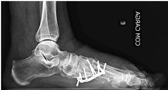
Figure 1. Radiographic evidence of hardware loosening in the left foot.

ring does not lead to higher nonunion rates. Moore et al. (17) reported that patients with vitamin D deficiency, in addition to endocrine diseases such as thyroid dysfunction and parathyroid disease, are 8.1 times more likely to develop nonunion, with a statistically significant difference compared with the control group.