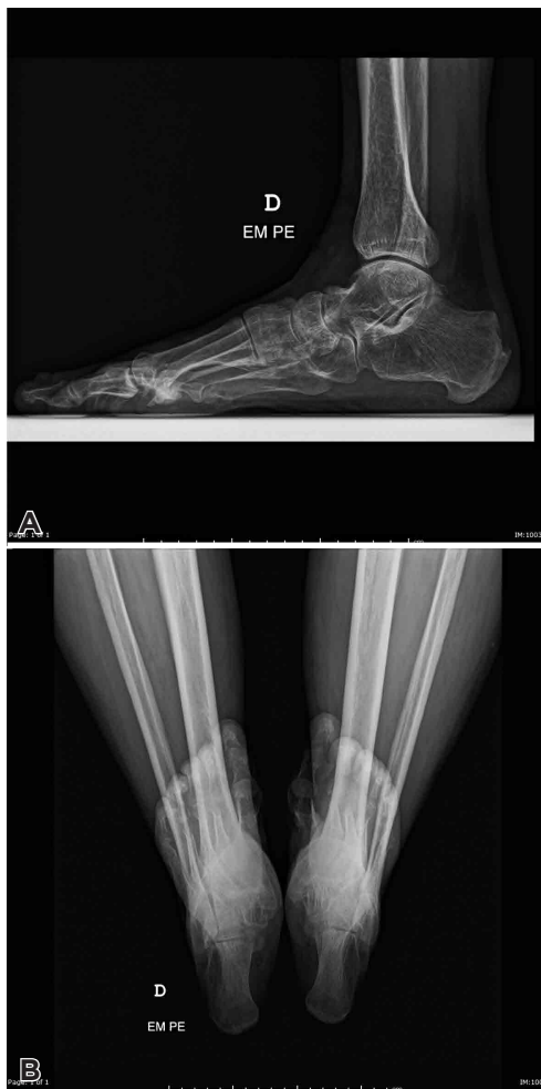
Figure 4. A) Weightbearing lateral and B) long axial view radiographs of the foot and ankle, demonstrating a normal foot arch and hindfoot alignment.