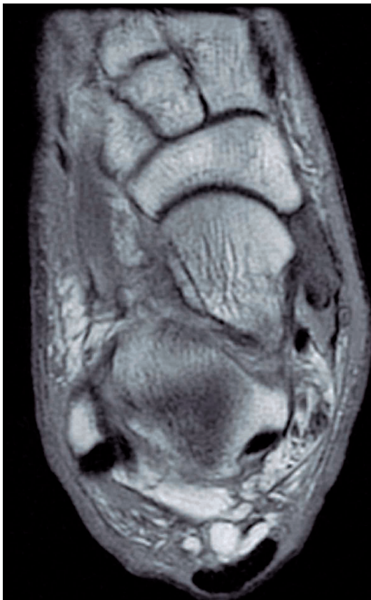
Figure 1. Axial proton-density weighted MRI revealing a large amount of effusion, tenosynovitis, and a suspected high-grade partial-thickness tear of the PTT.

At 24-month follow-up, the VAS-Pain decreased from 9 (preoperatively) to 1. The FAOS increased from 16% (preoperatively) to 94%, scoring zero on all items of the quality of life subscale. The patient progressively returned to his normal routine and only reported slight pain over the course of the PTT. No swelling was observed on the medial retromalleolar region of the ankle, the foot had a normal arch, and he had a positive, symmetric bilateral heel rise test (Figures 3A and 3B). Weight-bearing AP and lateral radiographs of the foot and ankle, as well as a long axial view, demonstrated normal foot arch and hindfoot alignment (Figures 4A and B).