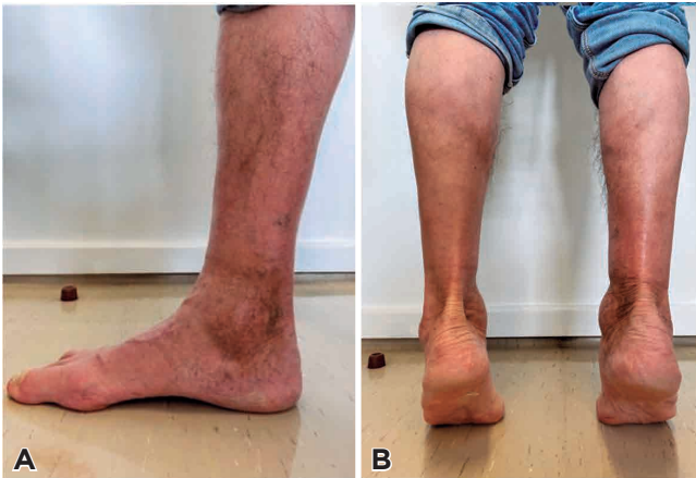
Figure 3. Two-year postoperative images of the right foot and ankle demonstrating A) a normal arch and no swelling on the medial retromalleolar region of the ankle and B) a symmetric bilateral heel rise test.