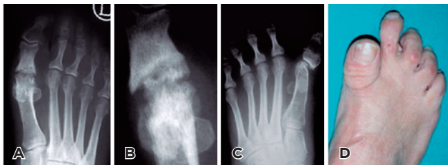
Figure 2. Complications of the Keller technique. A) Stiffness; B) Necrosis; C) Instability and secondary deviation; D) Excessively short Hallux

The most frequent complications of resection arthroplasty are (Figure 2):