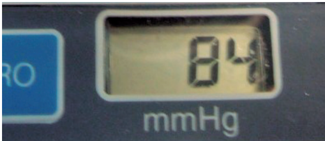
Figure 3. Image showing pressure during maximal passive dorsiflexion measured in mmHg before hallux valgus surgery on the left foot.