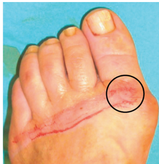
Figure 1. Image obtained before hallux valgus surgery on the left foot and focusing on the insertion site of the needle to assess pressure of the metatarsophalangeal joint of the first ray.

Three consecutive measures were taken before surgical intervention. The first one was obtained with the patient in the supine position and the joint in a joint position, in order to assess the so-called baseline or resting pressure. For the second measure, a maximal passive dorsiflexion maneuver was performed, and pressure is shown on the display of the gauge held by an assistant (the pressure gauge is not sterile). Finally, a third measure was obtained placing the hallux in maximal passive plantar flexion (Figures 1, 2, 3 and 4).