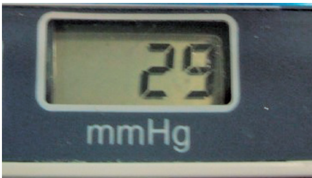
Figure 4. Image showing pressure during maximal passive plantar flexion measured in mmHg before hallux valgus surgery on the left foot.