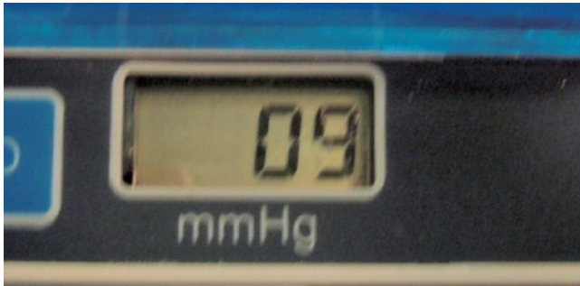
Figure 2. Image showing resting pressure in mmHg before hallux valgus surgery on the left foot.

Comparative analysis between mild HV and early-stage HR was performed using the Mann-Whitney test for comparison of medians. Statistical significance was set a p-value of <0.05.