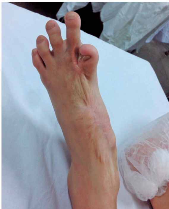
Figure 1. Patient with left hallux shortening.