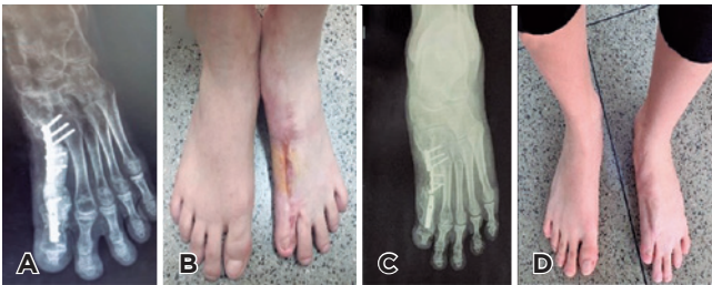
Figure 5. A-B) Radiological and clinical evaluation after six months and C-D) five years of follow-up.

any subsequent surgery, even with functional shortening, reporting being satisfied with this result.