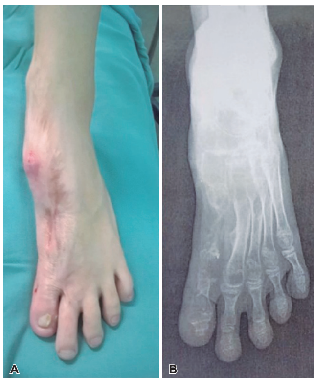
Figure 3. A) Postoperative appearance and radiography. B) After external fixator removal.