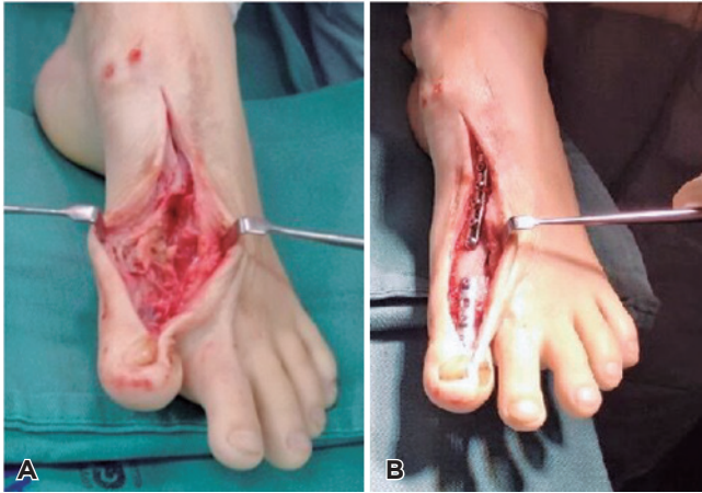
Figure 4. A) Intraoperative after bone elongation and B) Intraoperative after grafting and placement of plates.