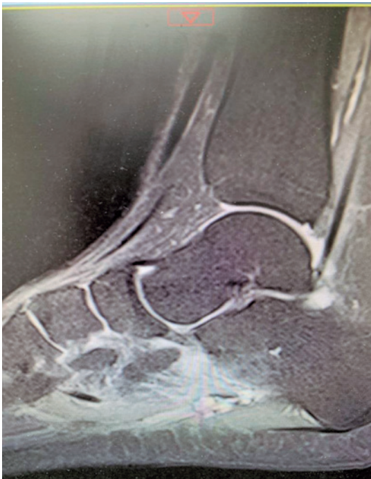
Figure 4. T2-weighted sagittal MRI scan performed in 2019 showing recurrence of the plantar lesion in a postoperative fibrosis area.

In June 2019, the patient returned to the medical office complaining of recurrence of symptoms in a pattern similar to that previously shown. The physical examination yielded the same results: no palpable masses, localized pain, with subtle improvement in the forefoot callus; the only difference was the presence of the surgical scar. She again underwent an MRI examination (Figure 4), which showed a new lesion with similar characteristics to the previous lesion, causing osteitis in the adjacent calcaneus.