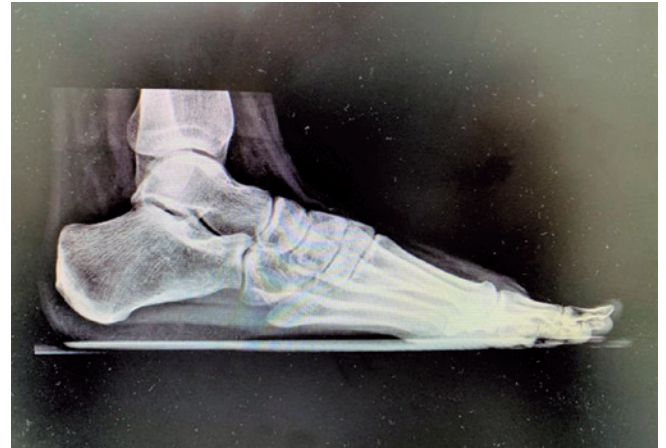
Figure 2. Profile radiograph of the left foot. No lesions were visualized.

tion of capillary, venous and arteriolar vessels without atypia, compatible with an angioleiomyoma. After excision, the patient had complete improvement in pain and restored function.