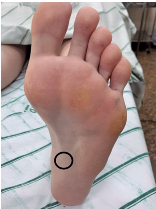
Figure 1. Plantar inspection of the foot showing callused areas in the forefoot and delimitation of the tender area on palpation, without evidence of a mass.