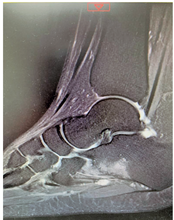
Figure 3. T2-weighted sagittal MRI scan performed in 2017, which showed a hypersignal plantar lesion within the soft tissue causing adjacent bone edema in the calcaneus.