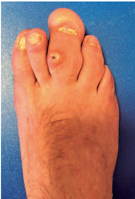
Figure 1. Photo before surgery.

All treatment options described in the literature were evaluated and forefoot remodeling was eventually considered to be the best alternative. The first surgical intervention consisted of reconstruction of the third toe, with resection of excessive adipose tissue, phalangeal remodeling and removal of excess skin (Figure 3).