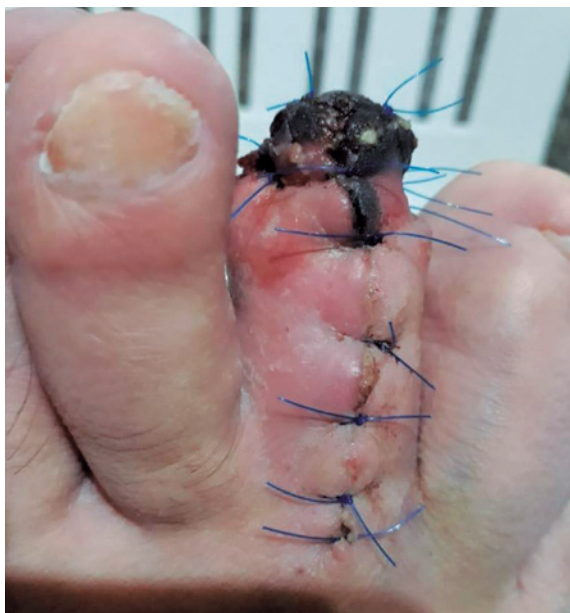
Figure 5. Post-operative distal finger necrosis.