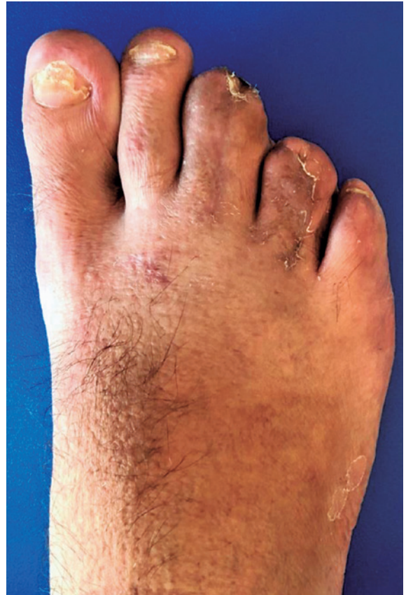
Figure 6. 40 days post-operative.

It is usually diagnosed at birth (1,3) and has an equal sex ratio. However, in our case, the patient sought consultation when he reached adulthood.