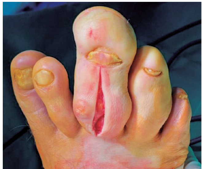
Figure 3. Longitudinal approach on third finger.