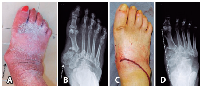
Figure 1. Localized prominence in the medial aspect of the right foot (dark dotted arrow) (1A) corresponding to the bony prominence of the medial and intermedial wedge, which is identified in the radiographic image of the foot (light dotted arrow) (1B). After surgical resection, improvement is visible in the foot contour (1C), with corresponding elimination of the bony prominence (clear dashed line) (1D).

The surgical modalities employed were as follows: 1) simple exostectomy (Figure 1), used to remove bony protrusions located in pressure areas, which was indicated when the foot and/or ankle were stable after the end of bone consolidation; 2) reconstructive bone surgery (Figure 2), used to realign seriously deformed and/or unstable bones and joints, indicated for extremities in which circulation is adequate and without active infection; 3) de-