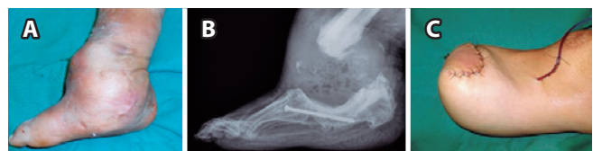
Figure 4. Medial view of a severely deformed and bulging right foot and ankle (4A). A lateral radiographic image of the foot and ankle (4B) shows extensive bone resorption after an unsuccessful surgical reconstruction attempt. The patient underwent transtibial amputation (4C).