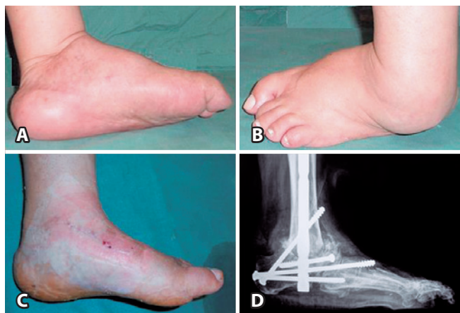
Figure 2. Photographic image of the medial (2A) and lateral (2B) projections of the left foot and ankle showing varus angular deformity. Panarthrodesis was used for correction of foot alignment with respect to the axis of the leg (2C) after reconstructive surgery (2D).