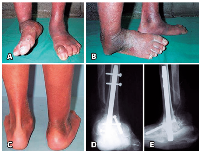
Figure 5. Photographs showing marked varus deformity and severe instability of the ankle, resulting in the lateral border of the right foot being used for support (5A) and pressure ulcer formation under the fibular malleolus (5B). Rear view of the lower limbs (5C) showing adequate alignment after tibiototalcalcaneal arthrodesis. Radiographic images show the correction obtained (5D and 5E).

Among the surgical modalities required during the treatment of type IV NCA, exostectomy was performed for resection of bone prominences in 3 of 35 extremities and showed a satisfactory outcome in all patients. However, reconstructive bone surgeries, performed in 25 of 35 extremities, showed satisfactory outcomes in only 14 of 25 extremities, which corresponded to 56% of the total. Of these, the final outcome was classified as good